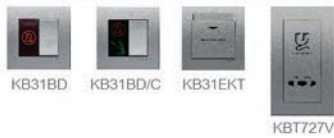
KB31BD KB31BD/C KB31EKT KBT72TV